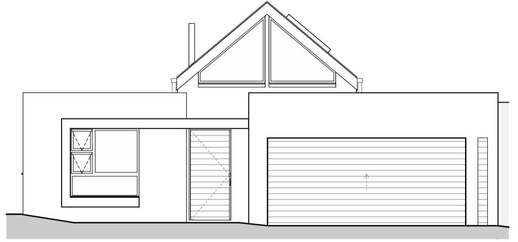
SOUTH EAST ELEVATION scale 1:100