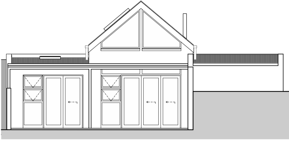
NORTH WEST ELEVATION scale 1:100