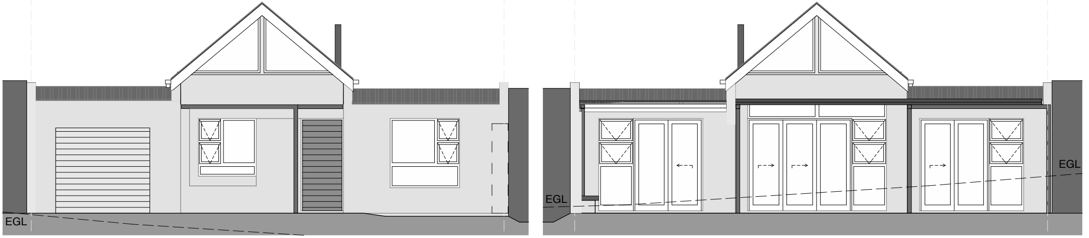
STREET ELEVATION scale 1:100